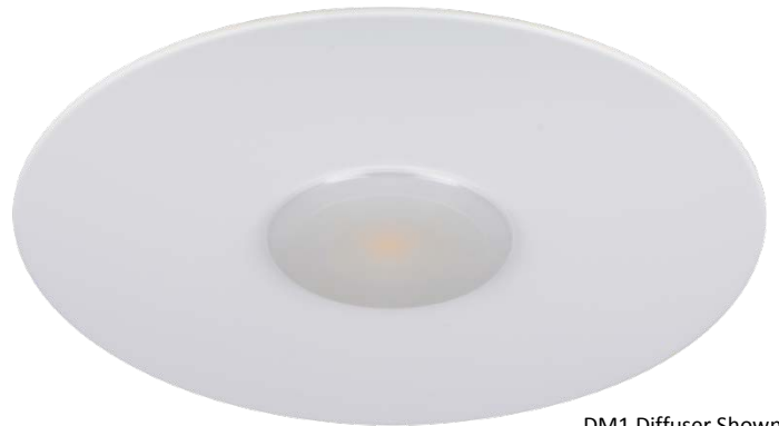
DM1 Diffuser Shown