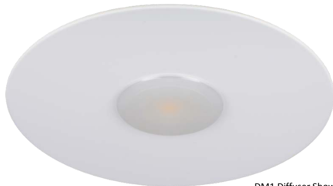
DM1 Diffuser Shown