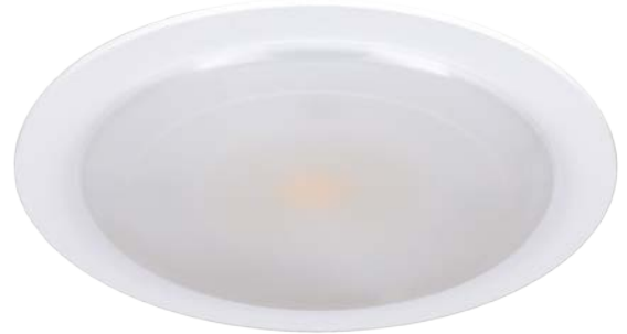
DM1 Diffuser Shown