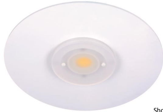
Shown with MD3 Diffuser

MADE IN USA – Both driver and fixture are designed, engineered and manufactured by Silescent Lighting in Ft. Lauderdale FL (ARRA & NAFTA compliant).